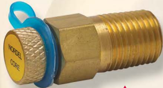
MODEL PT25NOR (1/4" NPT)