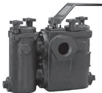
Models 792SH, 794SH

Strainers provide economical protection for costly pumps, meters, valves, and other similar mechanical equipment by straining foreign matter from the connected piping system. Installation of a strainer before mechanical equipment can ensure trouble free service and avoid costly shutdowns for repair or replacement of equipment damaged by foreign matter. The size of the perforation or mesh in the basket screen will determine the smallest particles captured. See pages Strainer Information section of the Mueller Steam Specialty Engineering binder for detailed information including sizes and materials available.