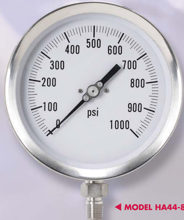
◀ MODEL HA44-8