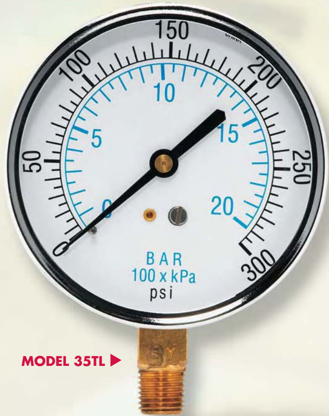
MODEL 35TL ▶